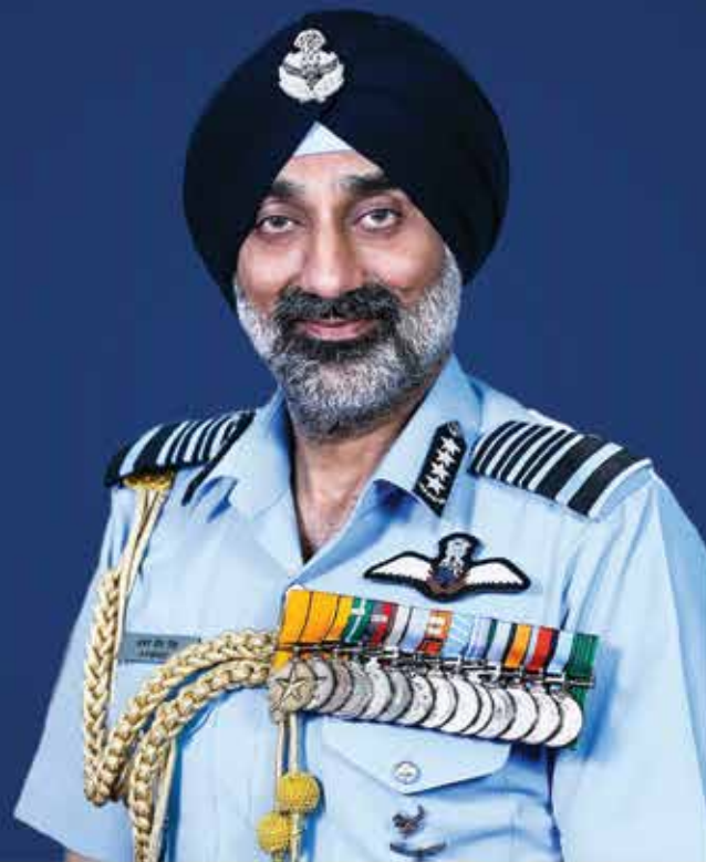
AIR CHIEF MARSHAL AP SINGH (CAS) PVSM AVSM

Air Chief Marshal AP Singh PVSM AVSM was commissioned into the fighter stream of the Indian Air Force on 21 December 1984. He is an alumnus of National Defence Academy, Defence Services Staff College, Wellington and National Defence College. He is a Qualified Flying Instructor and an Experimental Test Pilot with more than 5000 hours of service flying on a variety of fixed wing and rotary wing aircraft. Prior to taking over as Chief of the Air Staff on 30 September 2024, he held the appointment of Vice Chief of the Air Staff. We, the Team DSA, congratulate him for his new appointment. Under his guidance and experience, the Indian Air Force looks forward to scaling new heights.