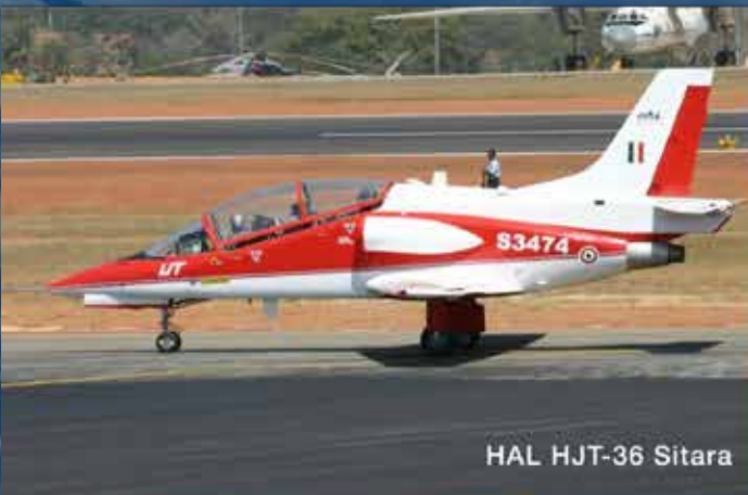
HAL HJT-36 Sitara